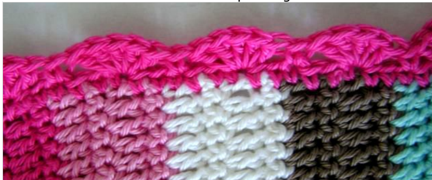
Detail of scalloped edge

Detail of finished neckline. Note that buttonholes are just gaps in the Scallop edging